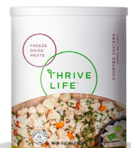
One Thrive Life family can contains between 10-12 cups of food on average.*